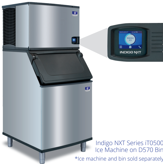
Indigo NXT Series iT0500 Ice Machine on D570 Bin *Ice machine and bin sold separately

Designed for operators who know that ice is critical to their business, the Indigo NXT Series ice machine's preventative diagnostics continually monitor itself for reliable ice production. Improvements in cleanability and programmability make your ice machine easy to own and less expensive to operate.