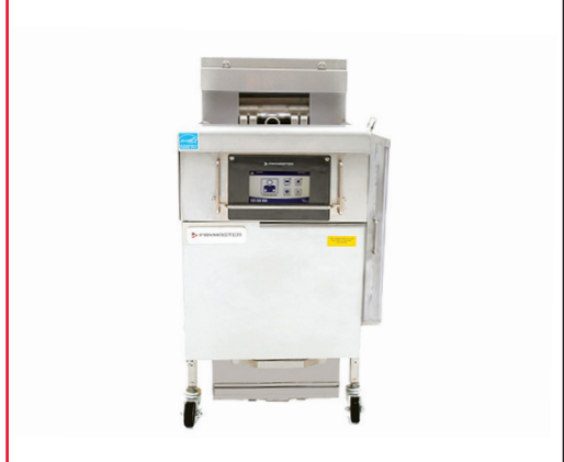
Model Shown: 3FQE60U