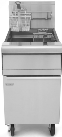
Shown with millivolt controller and optional casters