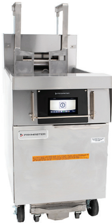
Model Shown: 1FQE80U